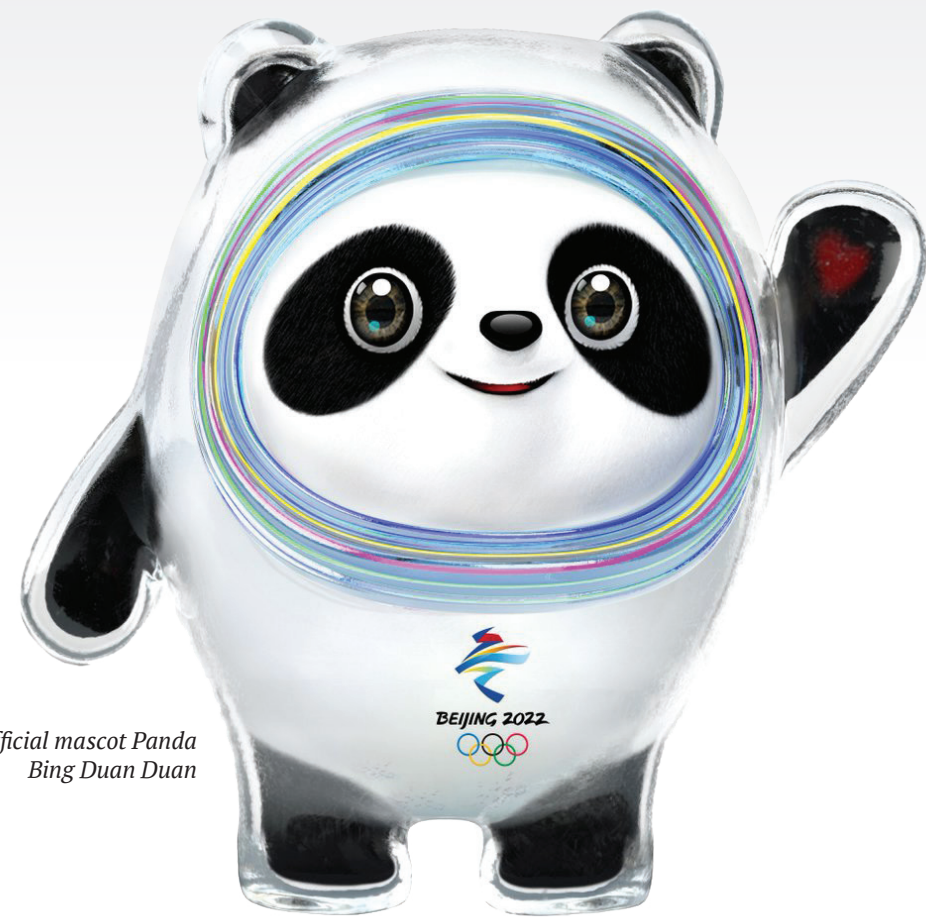
Official mascot Panda Bing Duan Duan